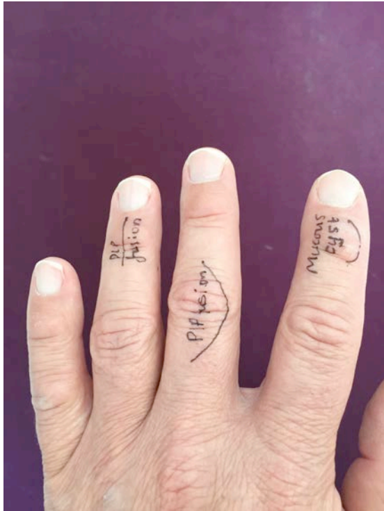
Interphalangeal fusion for Proximal (PIP) joint and Distal (DIP) joint, and excision of mucous cyst