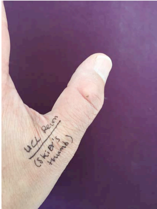
Ulnar collateral ligament repair for skier's thumb